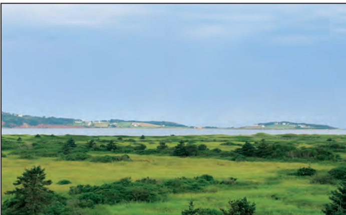
Port Hood Island.

Cover photos, clockwise from upper left: