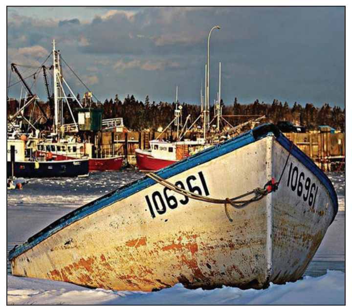
Yarmouth Harbour.

Email info@ruralcommunitiesfdn.ca Visit our website www.ruralcommunitiesfdn.ca