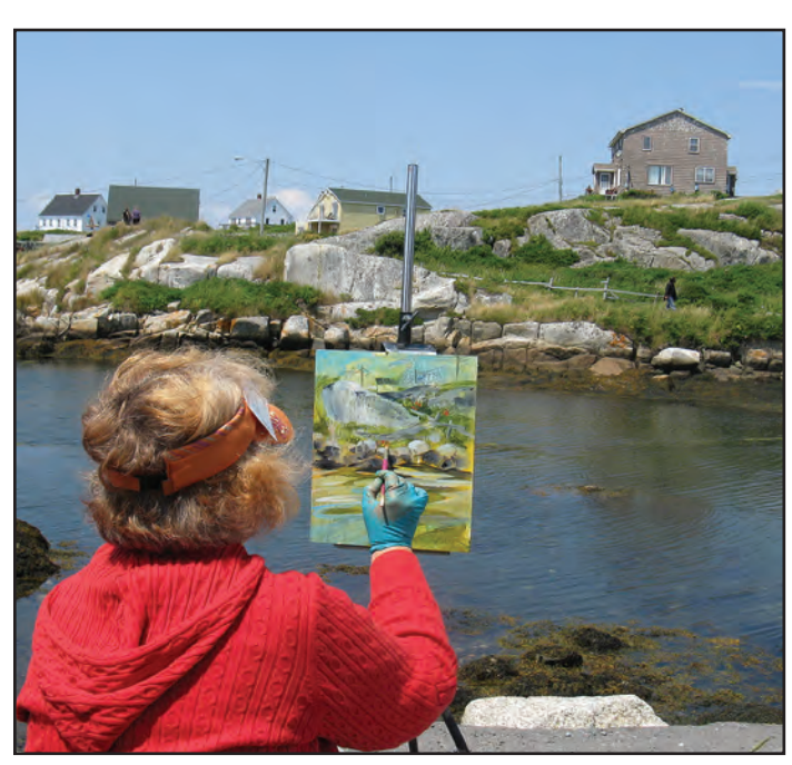
Painting in Peggy's Cove. Photo courtesy Elaine Frampton.

Email info@ruralcommunitiesfdn.ca Visit our website www.ruralcommunitiesfdn.ca